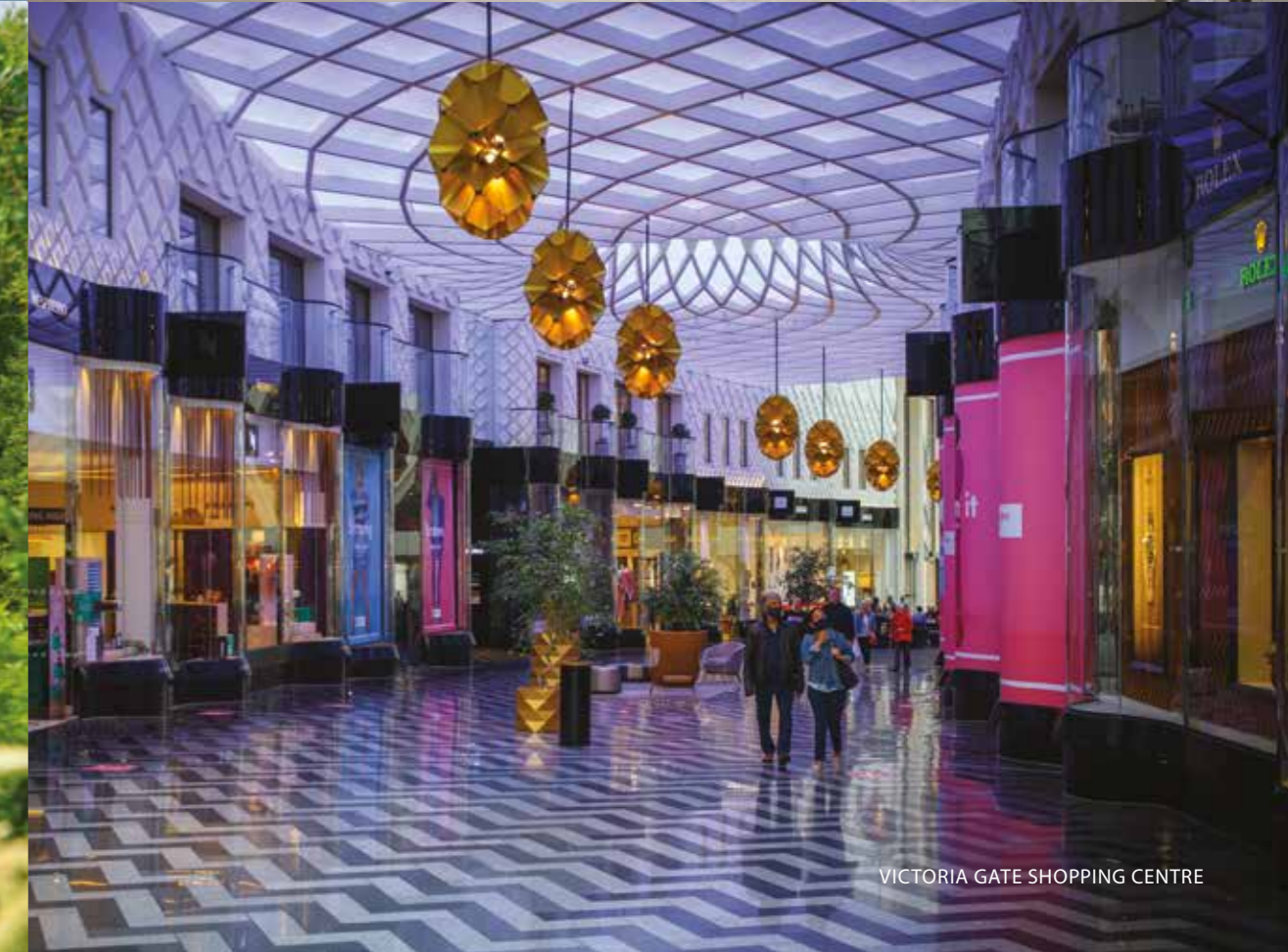
VICTORIA GATE SHOPPING CENTRE