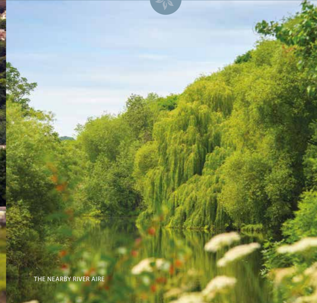
THE NEARBY RIVER AIRE